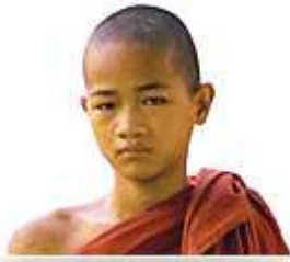
A Burmese monk